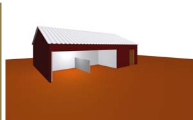
Figure 3 Shelter/ Tack Shed; Kirby Type