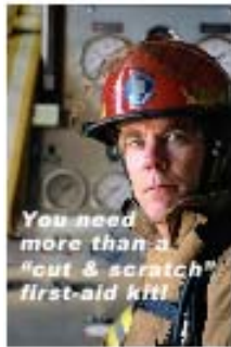
You need more than a "cut & scratch" first-aid kit!

In 95% of all emergencies, bystanders or victims themselves are the first to provide emergency assistance or to perform a rescue!